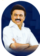
Thiru. M. K. Stalin Honourable Chief Minister

The Council was established in the year 1984 as an Autonomous Apex Body. It promotes socio-economic development through Science & Technology in Tamil Nadu by 16 State supported and 5 DST supported Science & Technology schemes for the benefit of people of Tamil Nadu.