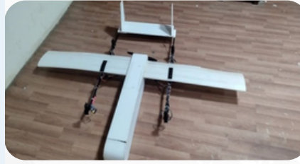
VTOL trial 1

Developed a hybrid fixed-wing Vertical Takeoff and landing (VTOL), used as a part of a smart farming technique. It focuses on designing and building a hybrid VTOL with cutting-edge navigational tools. When fitted with multispectral imaging payloads, our VTOLs can assist analysts and farmers in collecting field data.