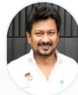
Thiru. Udhayanidhi Stalin Honourable Deputy Chief Minister

The Council was established in the year 1984 as an Autonomous Apex Body. It promotes socio-economic development through Science & Technology in Tamil Nadu by 16 State supported and 5 DST supported Science & Technology schemes for the benefit of people of Tamil Nadu.