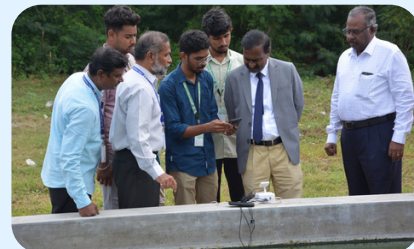
Spirulina cultivation at Jamal Mohammed College, Trichy

These initiatives have significantly contributed to improving livelihood, reducing socio-economic disparities and fostering self-reliance among SC/ST communities across Tamil Nadu.